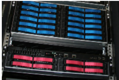
ID Bezel Design