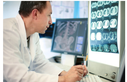
Medical IT solutions